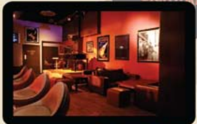
MANCHESTER 0161 819 7791