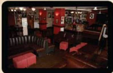
BRISTOL 0117 909 3405

WINNERS OF BEST ENTERTAINMENT PUB OF GREAT BRITAIN 2009